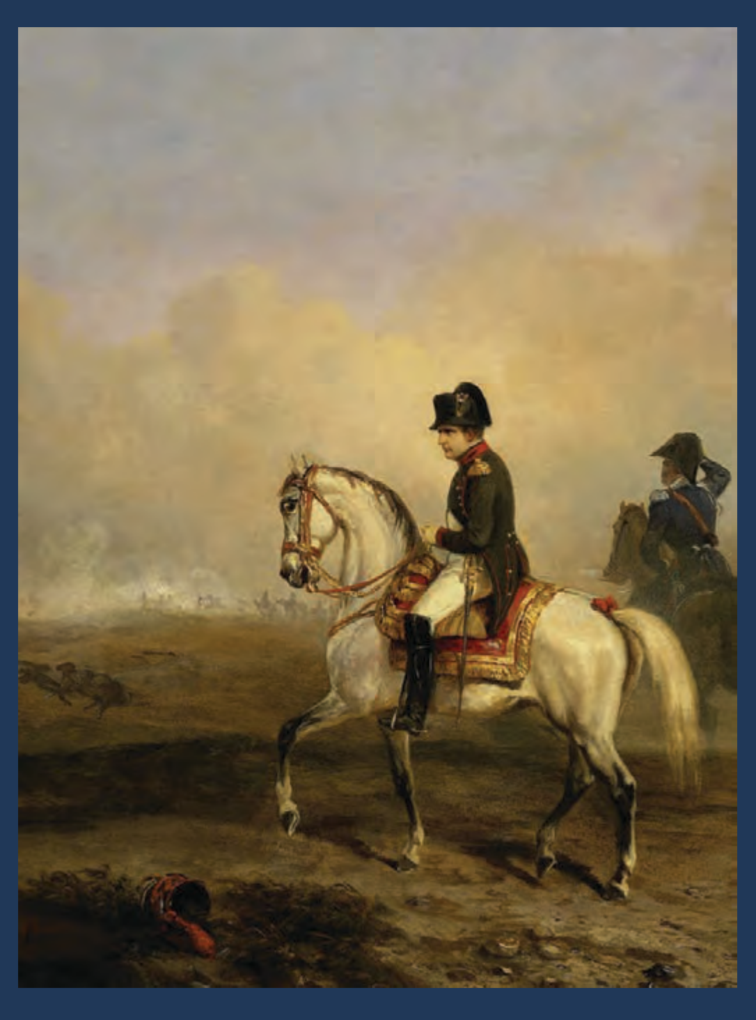
Emperor Napoleon I And His Staff On Horseback - Horace Vernet