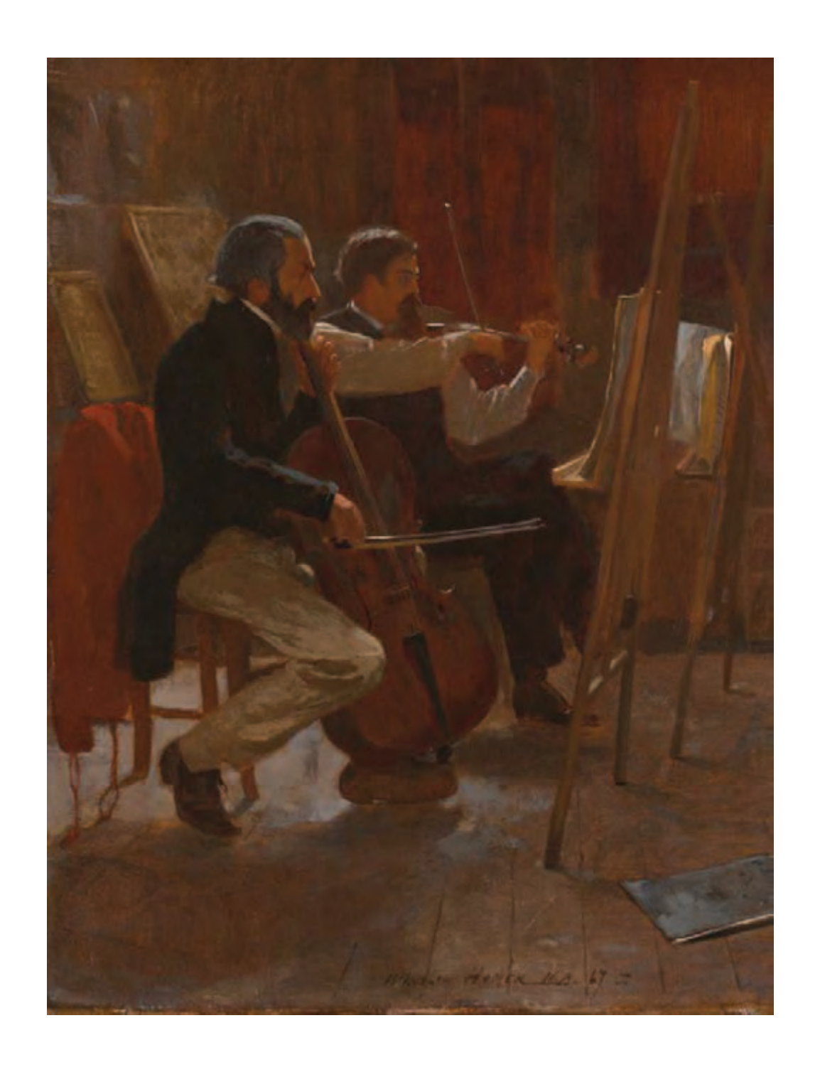
The studio - Winslow Homer