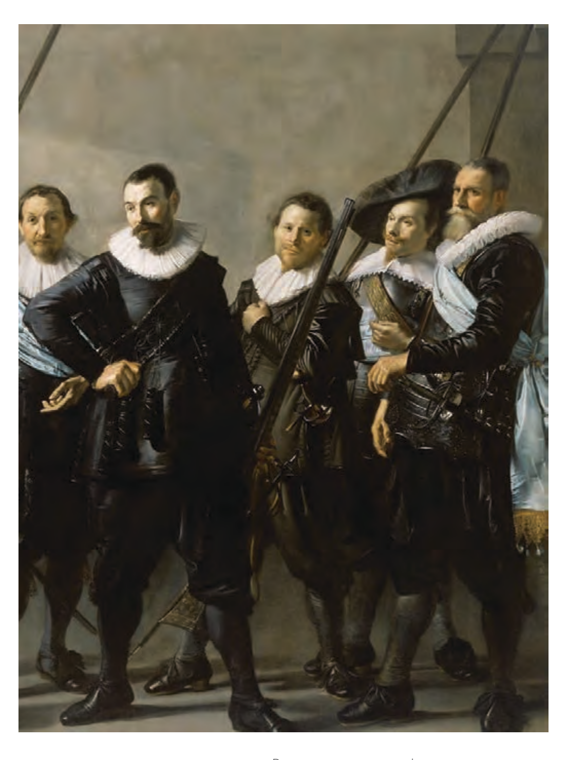
De magere compagnie - Frans Hals en Pieter Codde