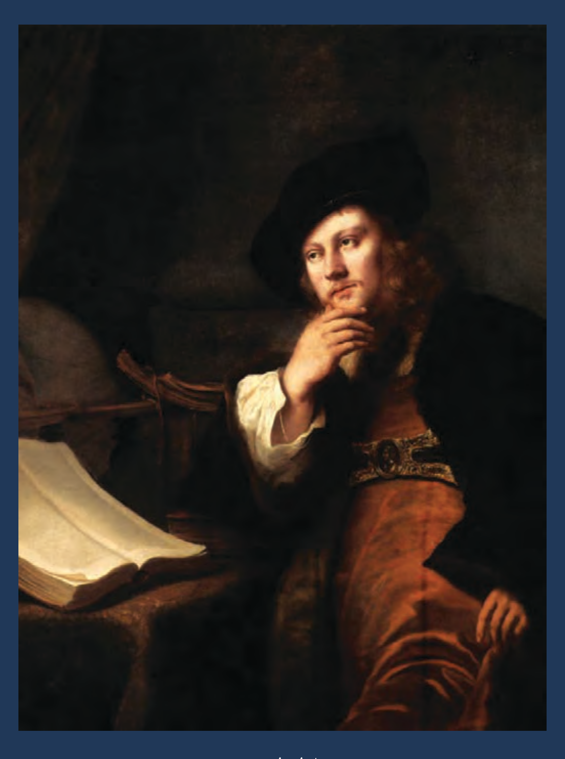
An Astronomer - Ferdinand Bol