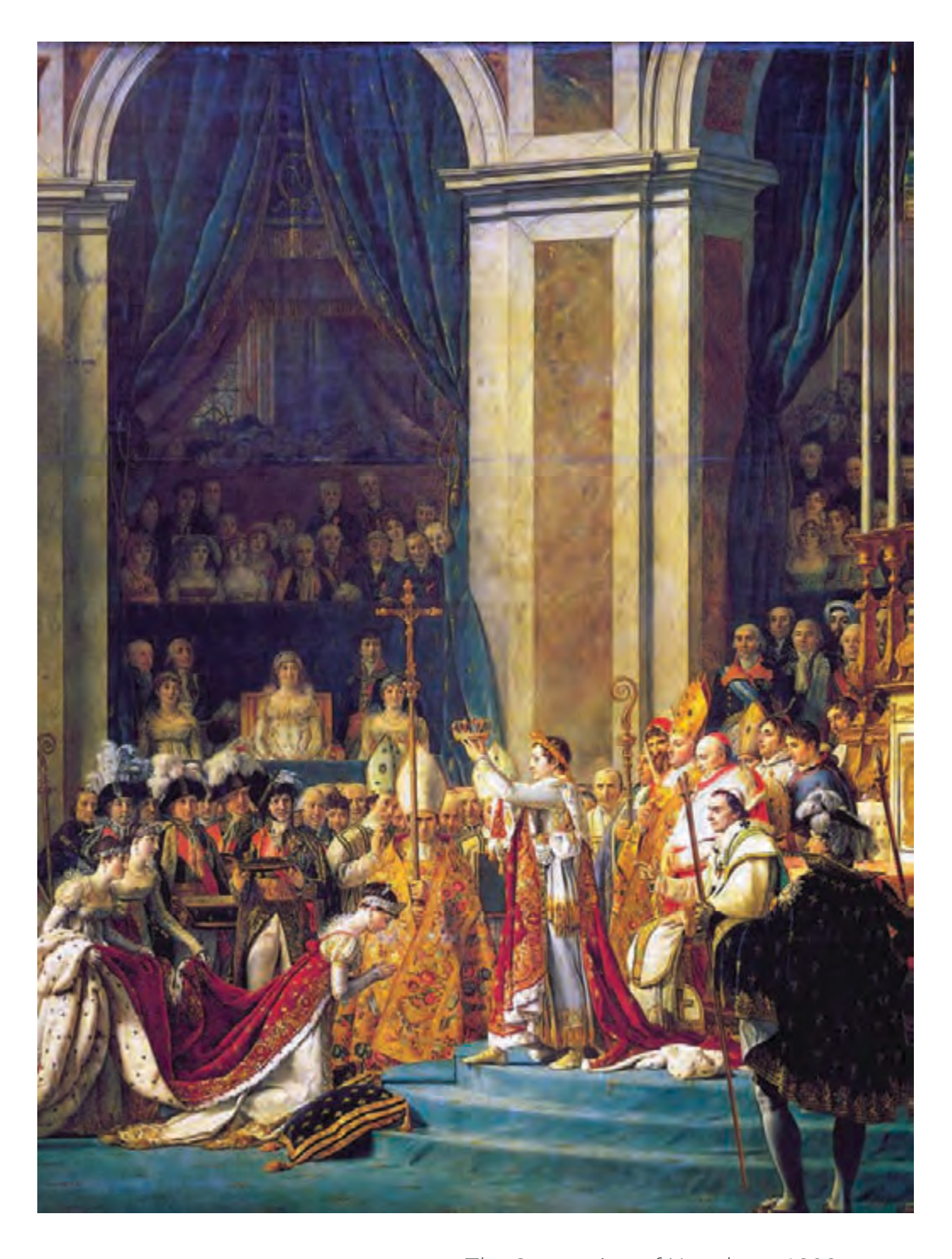
The Coronation of Napoleon, 1808 - Jacques-Louis David