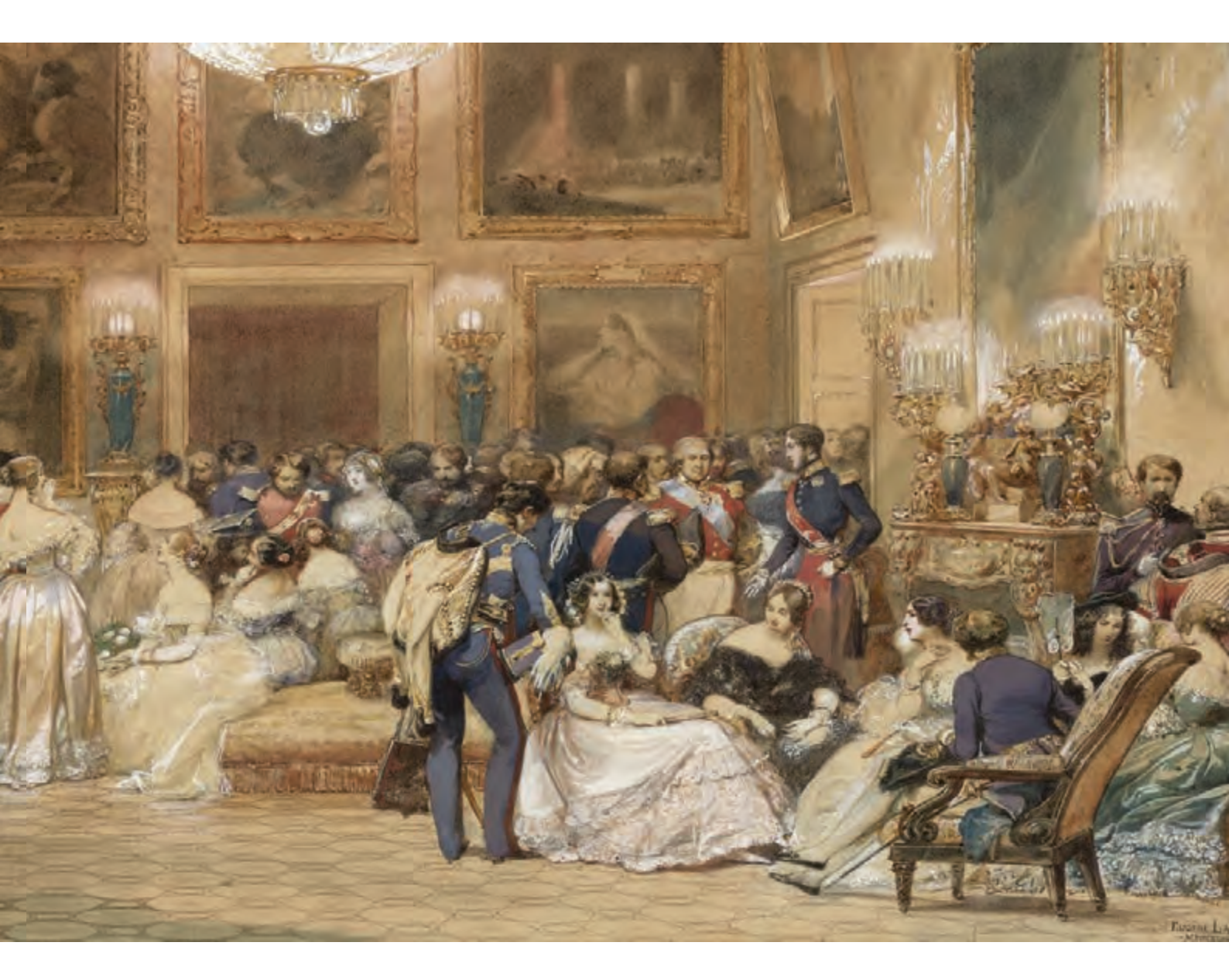
Une soirée chez le duc d'Orléans - Eugène-Louis Lami