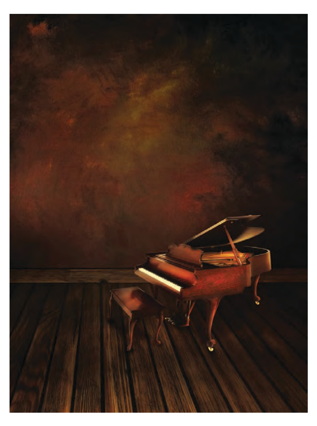
Background with Vintage piano - Mythja